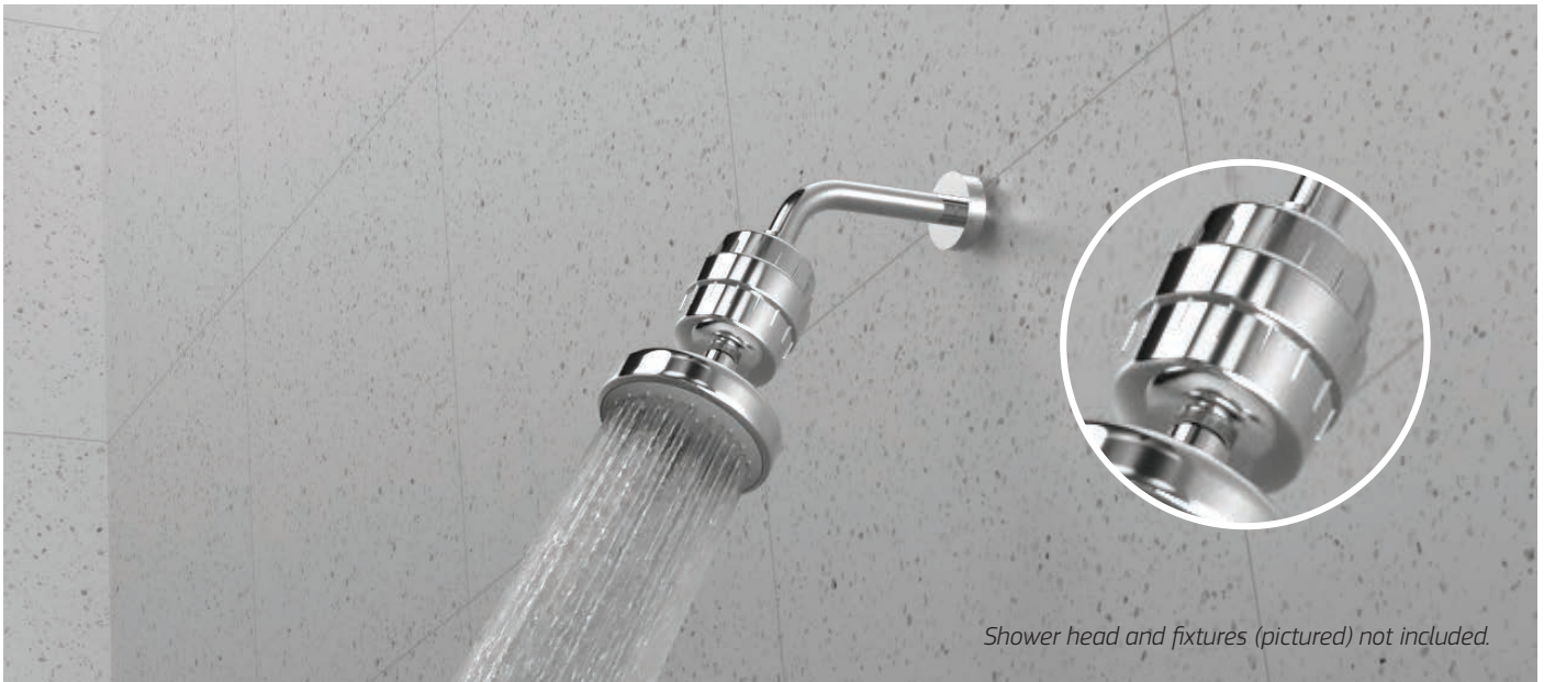
Shower head and fixtures (pictured) not included.